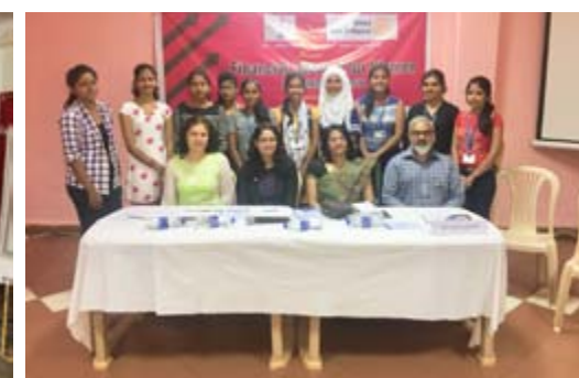
Financial Literacy Talk for Women