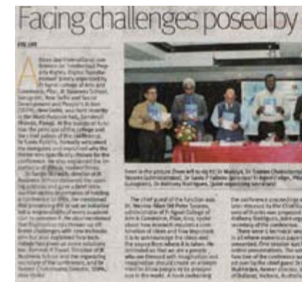
Facing challenges posed by digitisation. The article discusses the challenges of digitisation in the education sector and the need for schools to adapt to the changing landscape.