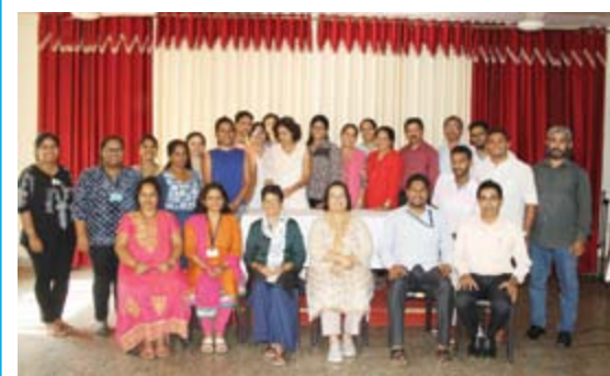
Faculty Development Programme