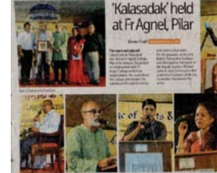
'Kalasadak' held at Fr Agnel, Pilar. The event was a musical performance by the students of the college. The performance was a success and was well-received by the audience.