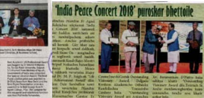
'India Peace Concert 2018' purosakar bhettoile. The concert was held in the market place of the village and was attended by students and faculty members. The concert was a success and was well-received by the audience.