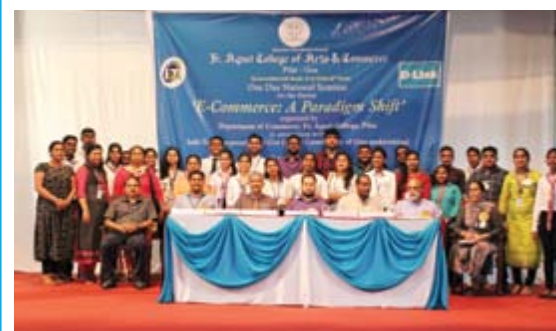
National Seminar on 'E-Commerce: A Paradigm Shift'