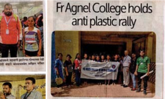
Fr Agnel College holds anti plastic rally. The rally was held in the market place of the village and was attended by students and faculty members. The rally was a success and was well-received by the participants.