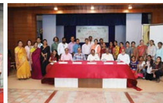
National Seminar on Konkani Literature