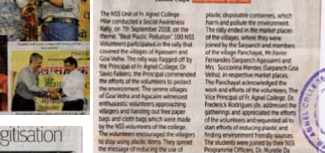
The NSS Unit of Fr Agnel College conducted a Social Awareness Rally. The rally was held in the market place of the village and was attended by students and faculty members. The rally was a success and was well-received by the participants.