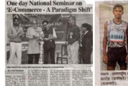
One day National Seminar on 'E-Commerce - A Paradigm Shift' was held at Fr Agnel College, Pilar. The seminar was organized by the college and was attended by students and faculty members. The seminar was a success and was well-received by the participants.