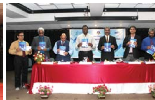
International Conference on Intellectual Property Rights: Digital Transformation