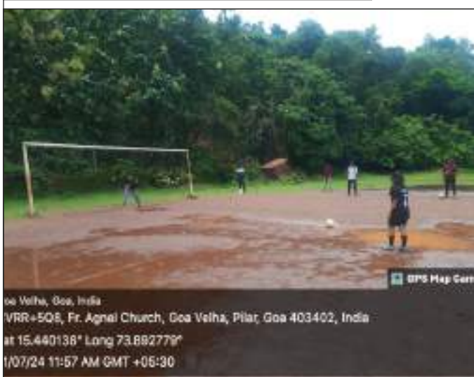
Goa Velha, Goa, India VRR+508, Fr. Agnel Church, Goa Velha, Pilar, Goa 403402, India at 15.440138° Long 73.892779° 11/07/24 11:57 AM GMT +05:30