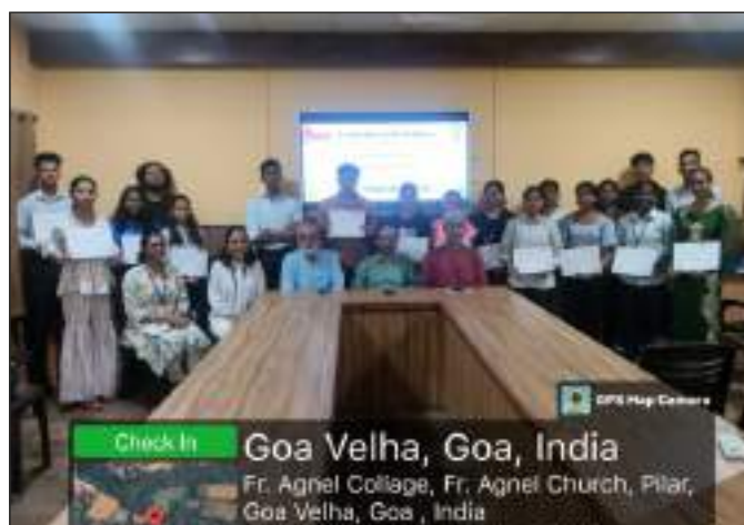
02 Credit (30 hours) Certificate Course on 'Tally Prime Pro with GST' - Batch 2 from 08.11.2024 to 18.11.2024.