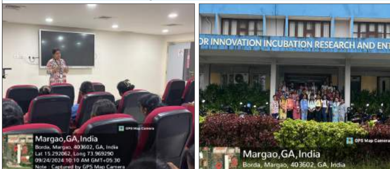
Visit to Incubation Centre at Don Bosco College of Engineering, Fatorda on 24.09.2024.