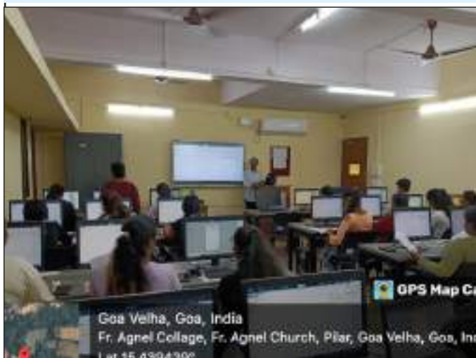
02 Credit (30 hours) Certificate Course on 'Tally Prime Pro with GST' - Batch 1 from 17.09.2024.