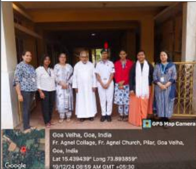
Goa Liberation Day celebrations to celebrate Goa's freedom from Portuguese Colonial rule on 19.12.2024.