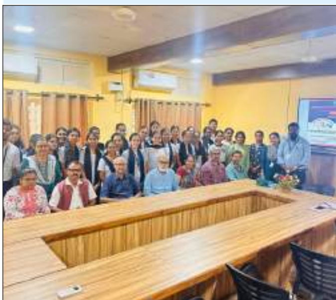
Public lecture was organised for the students on 15.11.2024. The resource person was Mr. Damodar Mauzo.