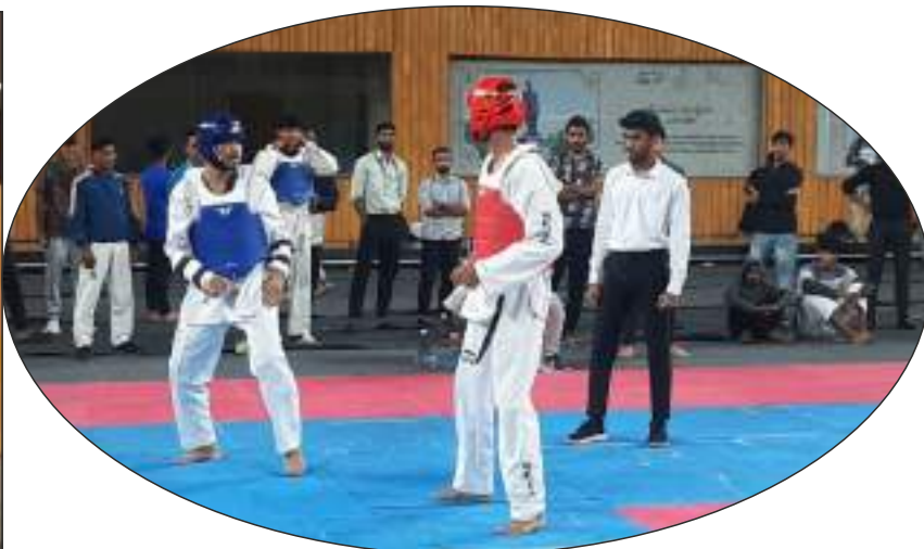
Inter-collegiate Taekwondo Championship at Goa University from 06.08.2024 to 09.08.2024.