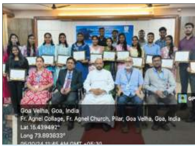
Felicitation Programme of Meritorious students of TYBCom/BA/BCA on 05.10.2024.