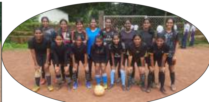
Intra-Mural Football Tournament for men and women from 09.08.2024 to 19.08.2024.