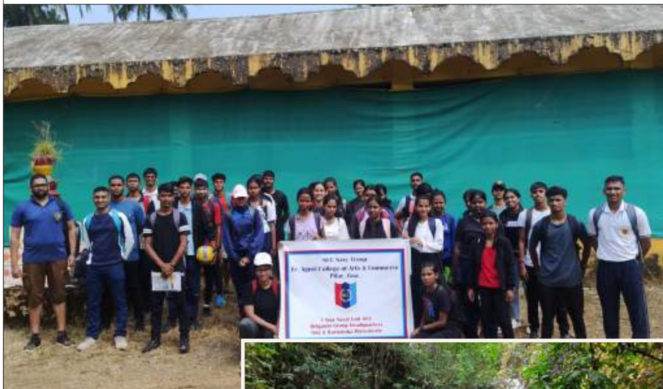
Nature Trek to Pale waterfall for NCC Cadets and others at Sattari-Goa on 08.10.2024. The activity was conducted to align with the theme of Fit India and Eco Tourism while also sensitizing the need for nature conservation amongst cadets and to emphasize on personal fitness.