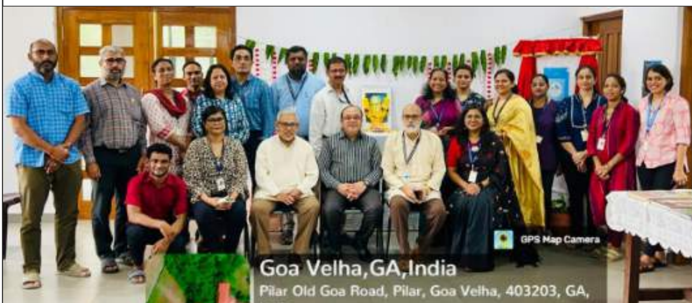
National Librarians Day and Inauguration of College Book Club on 12.08.2024.