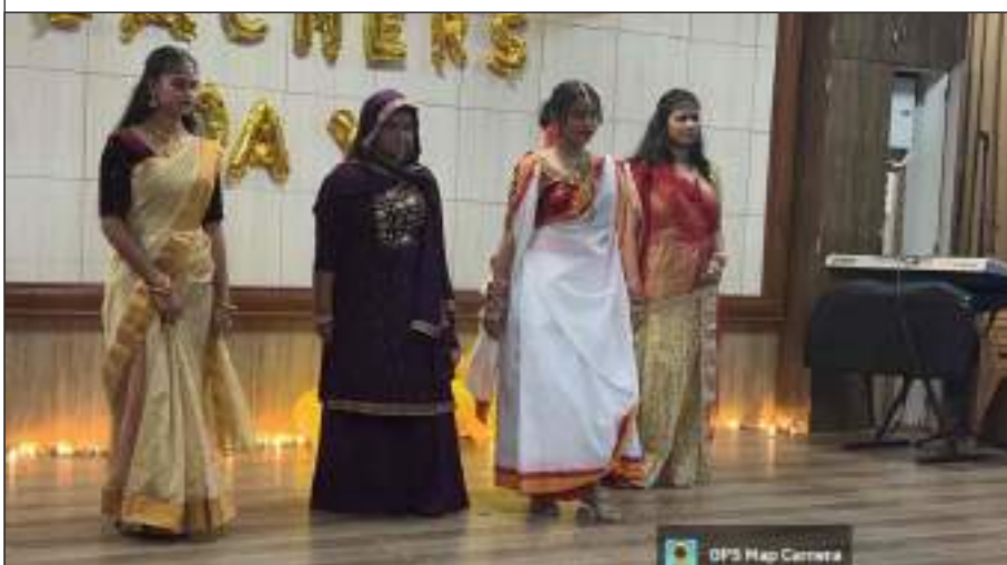
Solo Singing Competition and Fashion show on 05.09.2024.