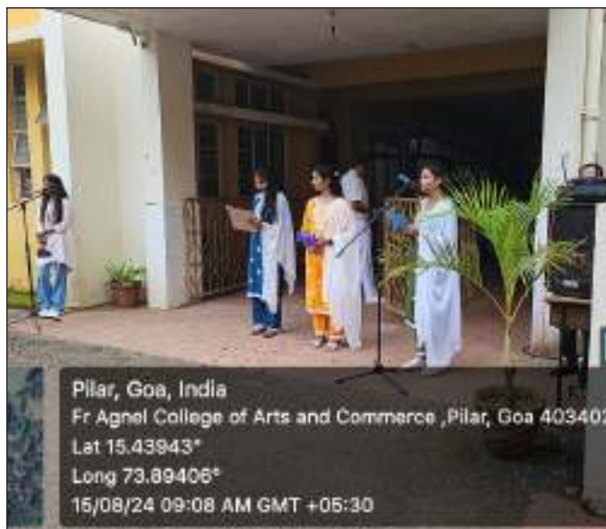
Quiz on Independence Day to bring awareness about the history of India's Independence on 15.08.2024.