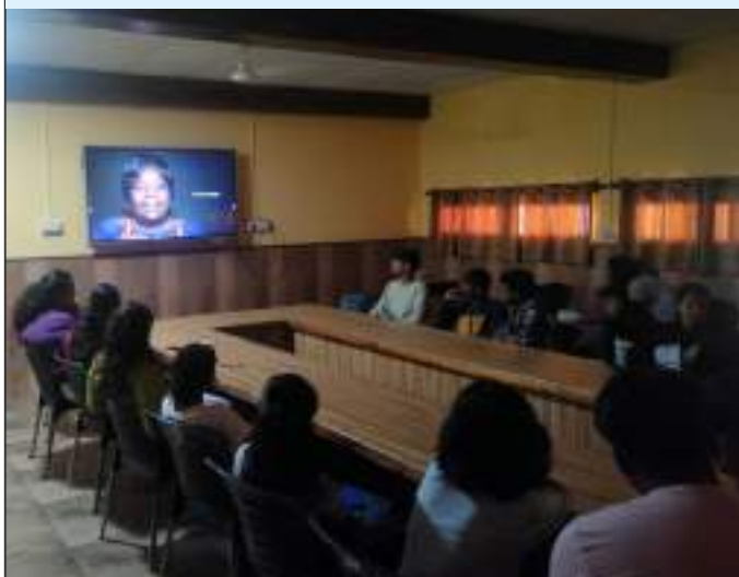
Screening of documentary on Women's Rights on 26.08.2024.