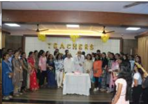
Teacher's Day Celebrations held on 05.09.2024.