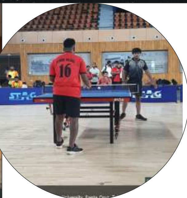
Inter-collegiate Table Tennis Championship at Goa University on 16.07.2024.