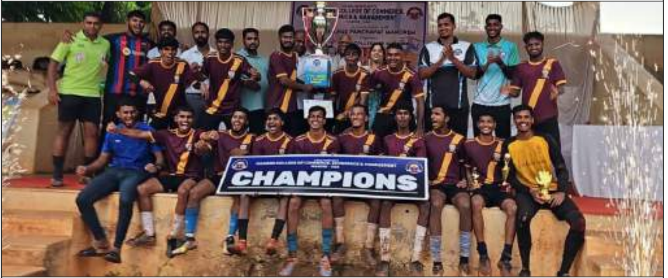
Champions at Inter-collegiate 9-a-side football tournament from 02.09.2024 to 03.09.2024.

Man of the match (three times) and Best player award