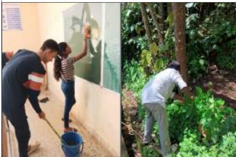
Campus Cleaning drive on 18.09.2024.