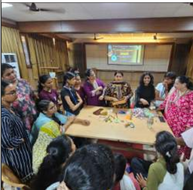
Handwork Clay Jewellery Workshop on 23.09.2024.