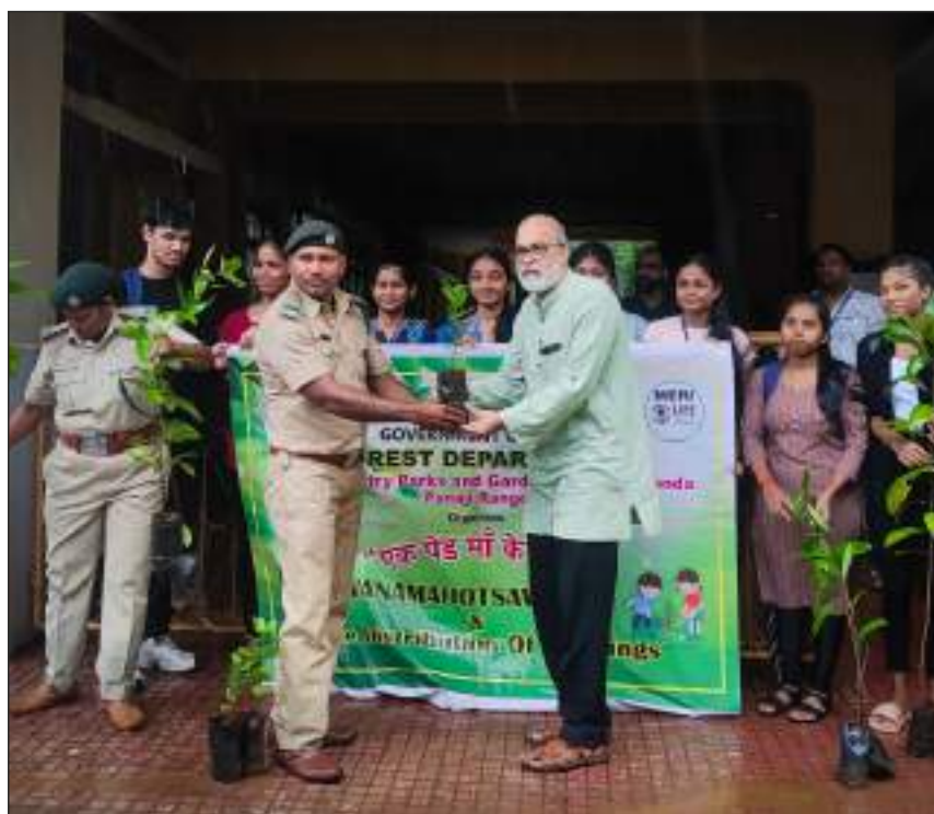
Fruit Sapling Distribution drive on 03.08.2024.