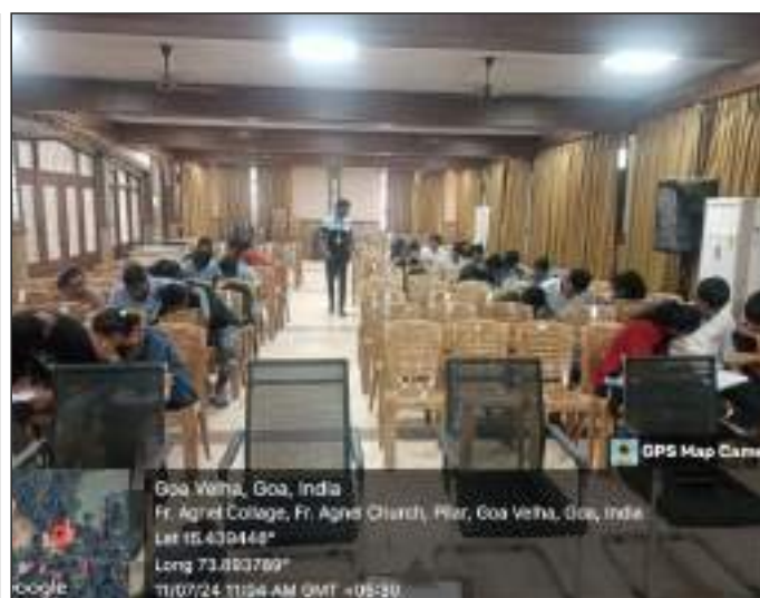
Goa Velha, Goa, India Fr. Agnel College, Fr. Agnel Church, Pilar, Goa Velha, Goa, India Lat 15.439448° Long 73.893769° 11/07/24 11:54 AM GMT +05:30