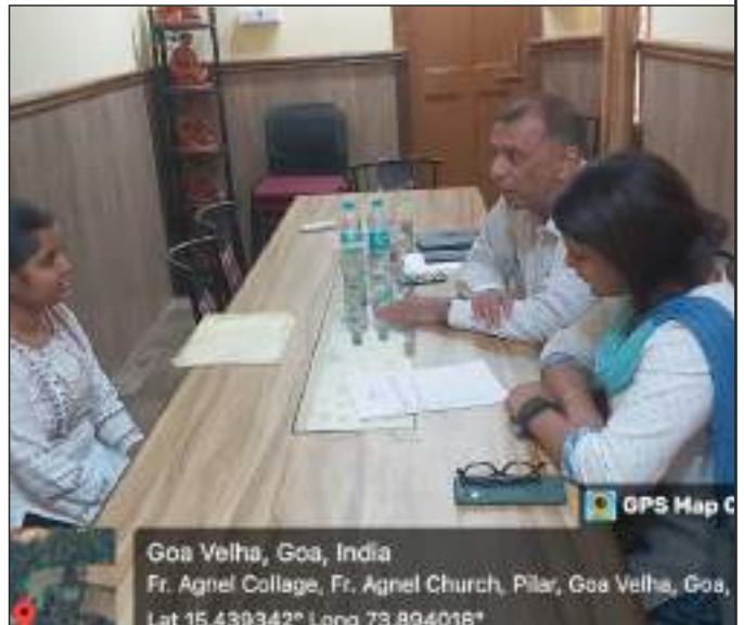
Campus Placement Drive on 19.11.2024 for the Company SYSCON GLOBAL which operates in the IT, Telecom and Hospitality sector.