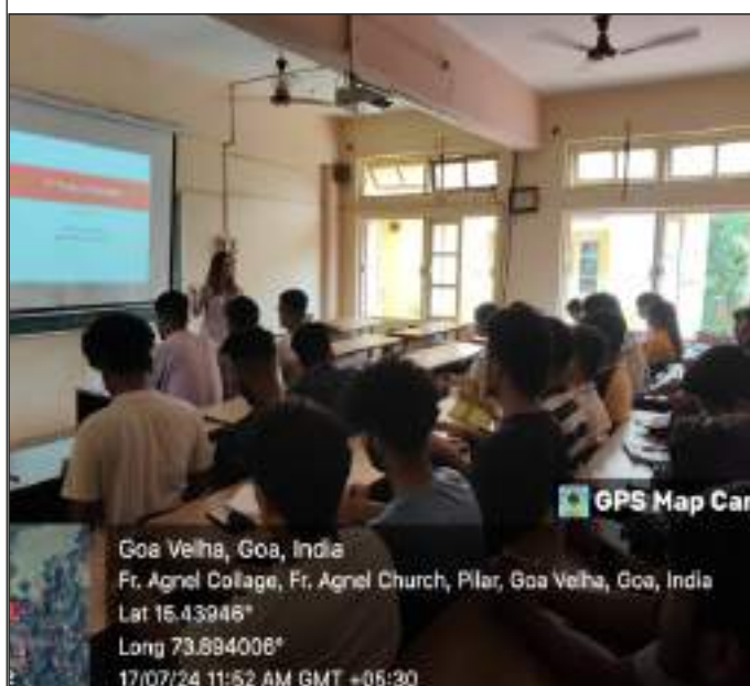
Project Orientation-BCA students on 17.07.2024.