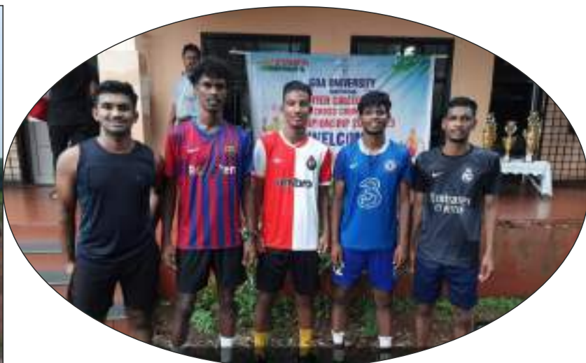
Inter-collegiate Cross Country Championship at Goa University on 17.08.2024.