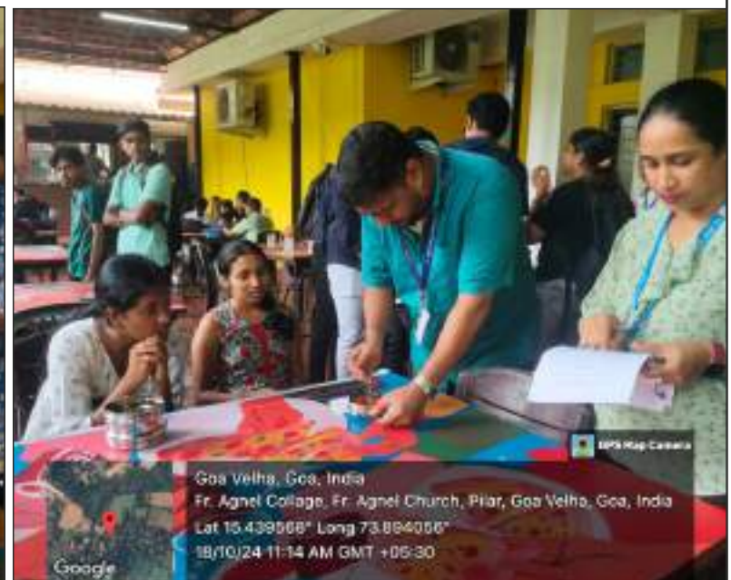
Poshan ka Tashan on 18.10.2024.