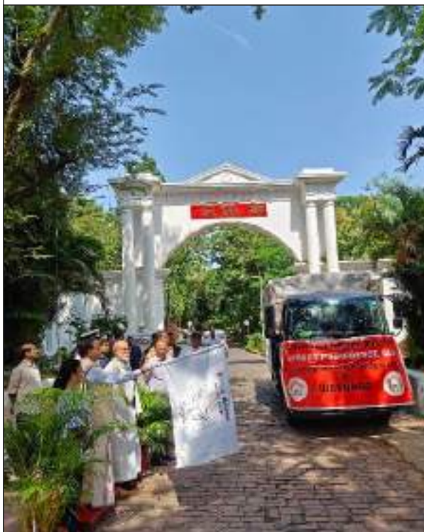
Wayanad Relief Drive from 08.08.2024 to 13.08.2024.