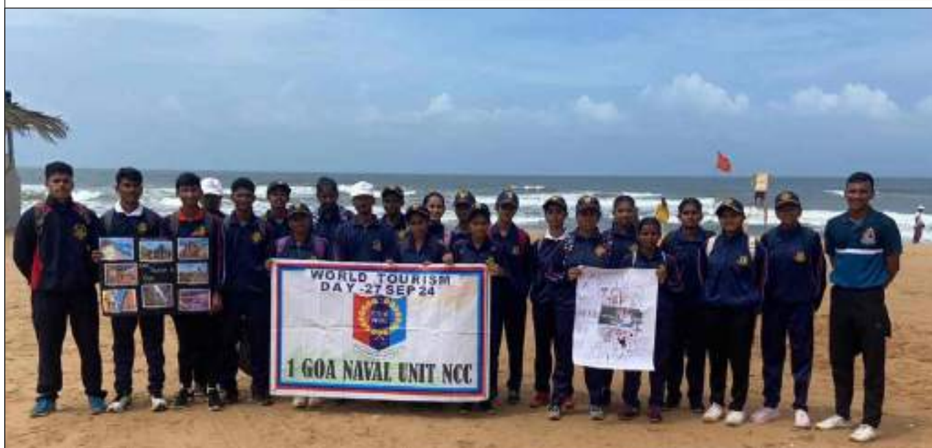
Beach Cleaning drive at Calangute Swachh Bharat Mission on 27.09.2024.