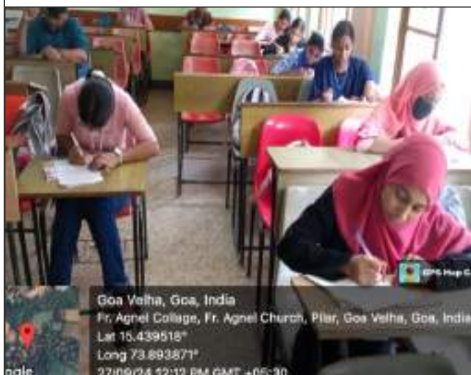
Essay Writing Competition on 27.09.2024.