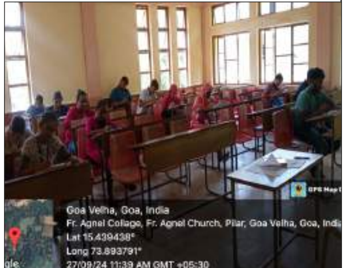
Dictation Competition on 27.09.2024.