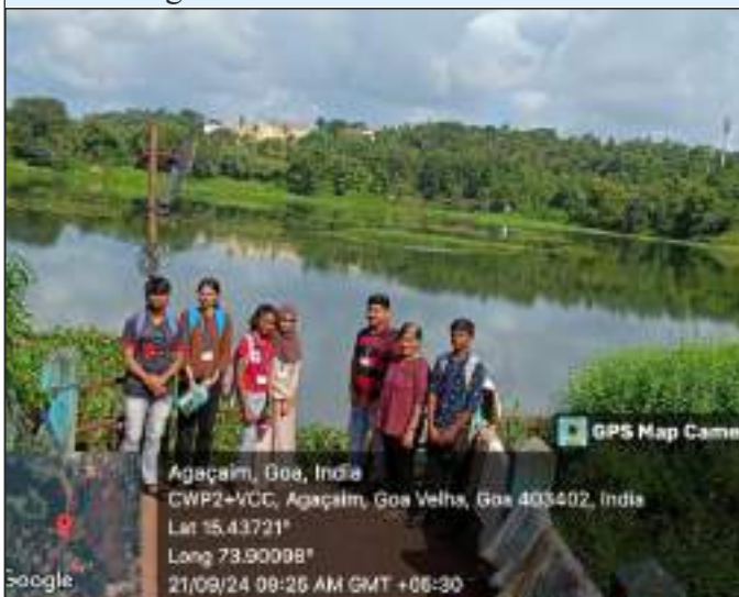
Field Trip to Pilar Lake (Surlabhat) on 22.09.2024.