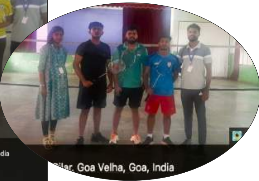
Pilar, Goa Velha, Goa, India