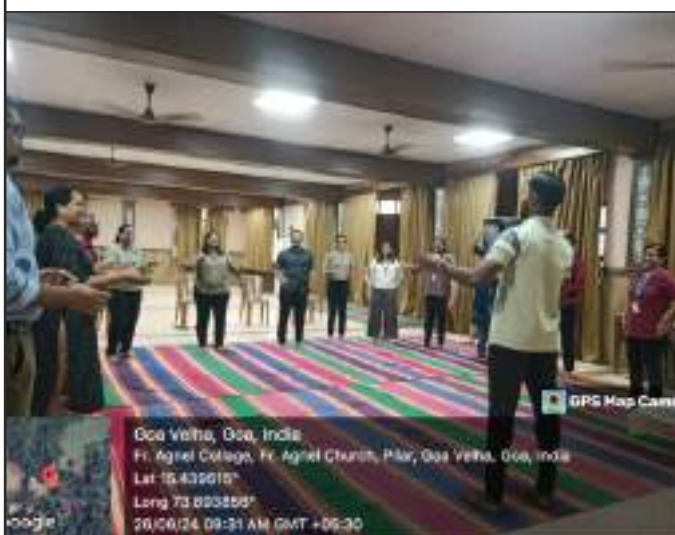
Soulful Serenity on 26.06.2024.