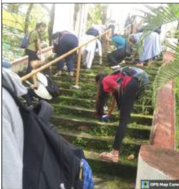
Heritage site clean-up on 27.09.2024.