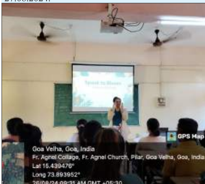
Workshop on 'Developing Presentation Skills, Job Application Writing and Resume Writing' on 26.08.2024.