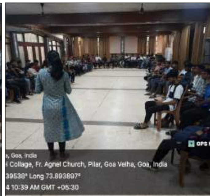
My College, My Fellow Team Players - Sports Orientation on 03.07.2024.