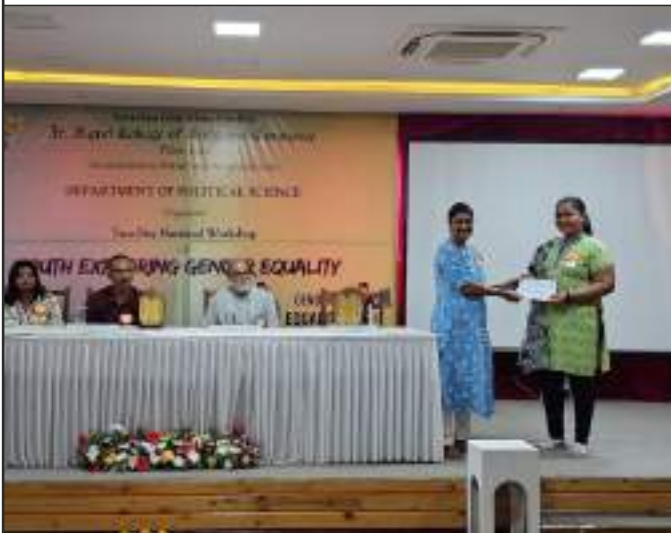
Essay Competition on 16.10.2024.