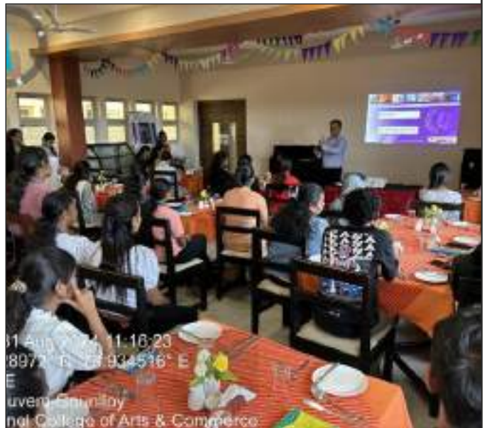
Participation of students for workshop on Food Safety, Healthy Eating and Table Etiquette at Agnel Institute of Food Craft and Culinary Services, Verna on 31.08.2024.