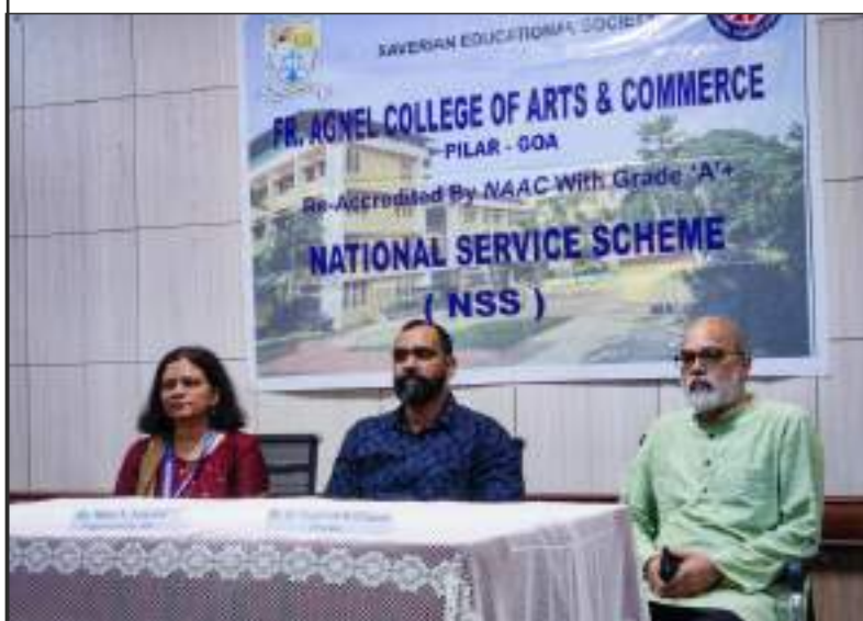
NSS Inaugural for 2024-2025 on 03.08.2024.