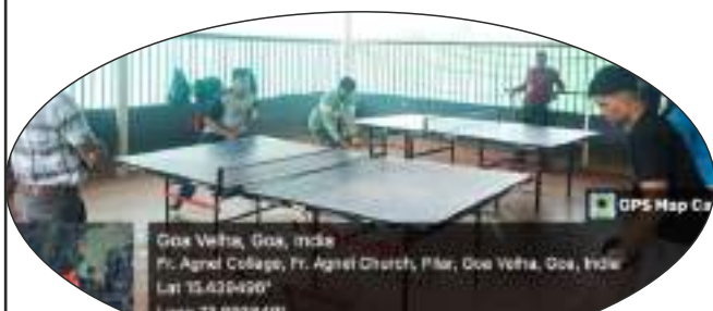
Intra-Mural Table tennis Tournament from 04.07.2024 to 05.07.2024.