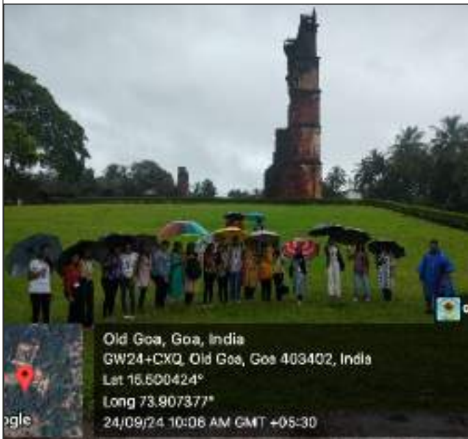
Heritage Walk in Old Goa on 24.09.2024.