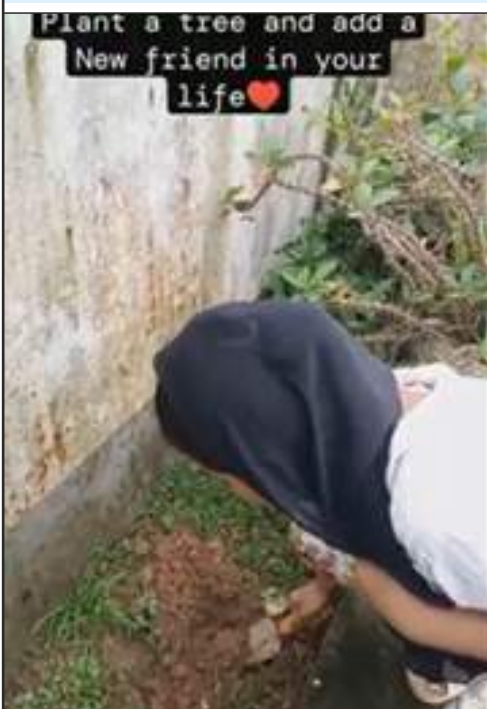
Shramdaan: Ek Ped Maa Ke Naam on 29.07.2024.