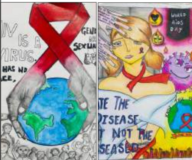
Art/Drawing Competition on 12.08.2024