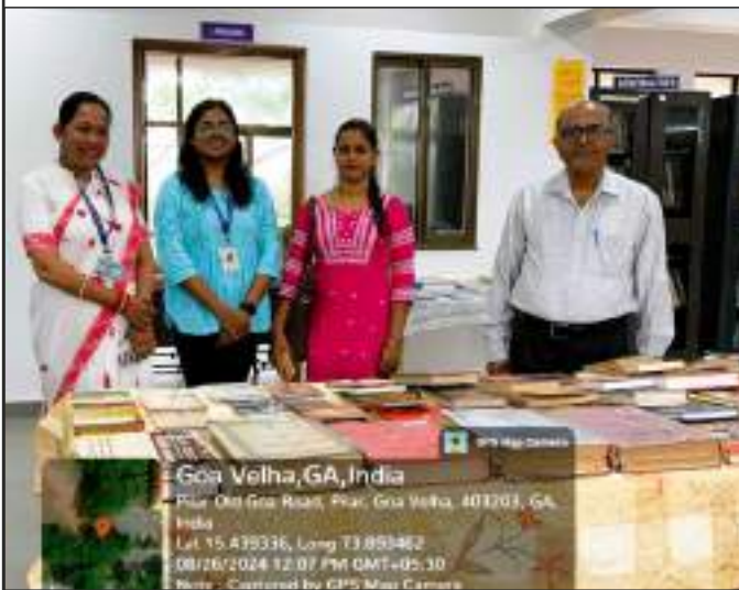
Konkani Bhasotsav: an exhibition of Konkani Literary Treasures on 26.08.2024 .