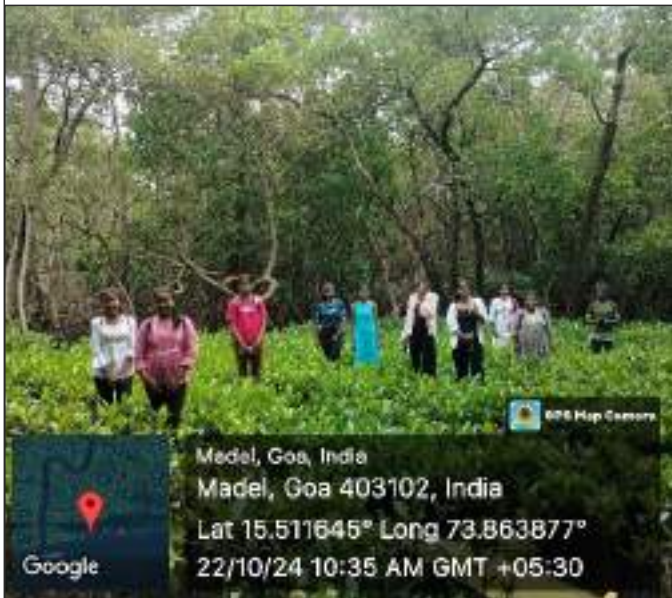
Field Trip to Salim Ali Bird Sanctuary, Chorao on 22.10.2024.