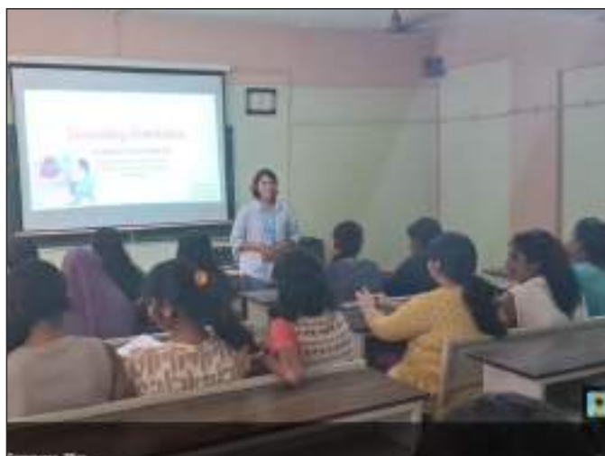
Counselling orientation from 24.07.2024 to 09.08.2024.