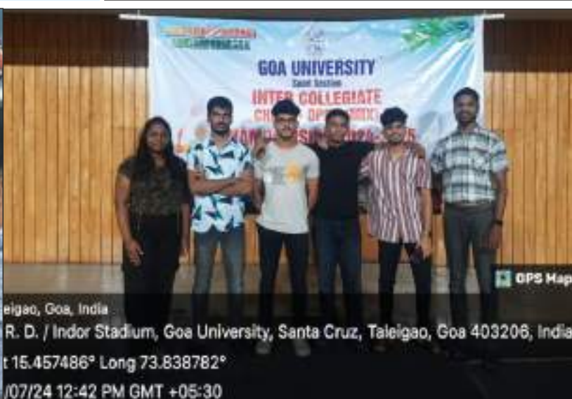
Inter-collegiate Chess Championship at Goa University from 23.07.2024 to 24.07.2024.