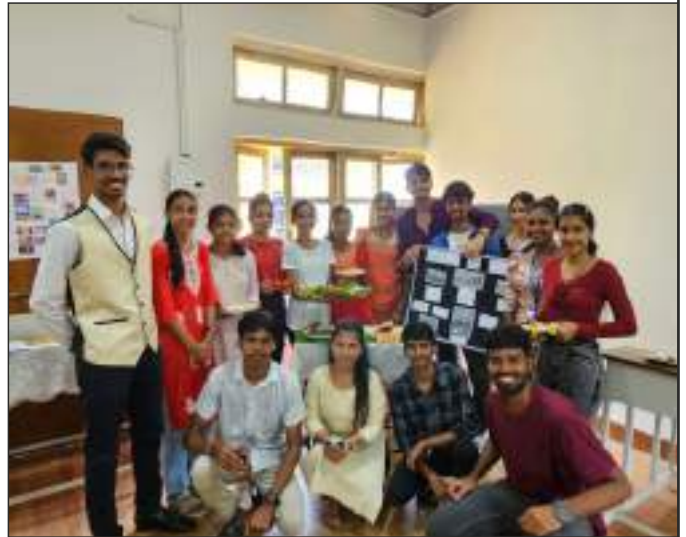
Goan Gallery Walk: Celebrating Culture and History on 31.08.2024.