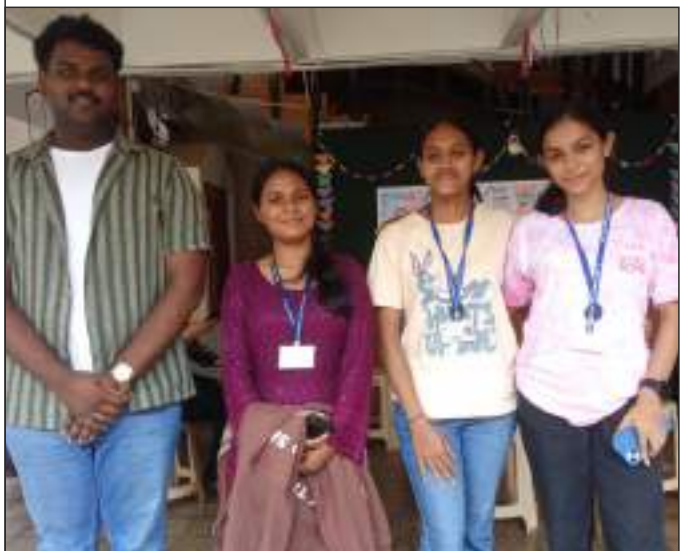
Participation in National Symposium on Gender Diversity at Carmel College, Nuvem on 26.09.2024.