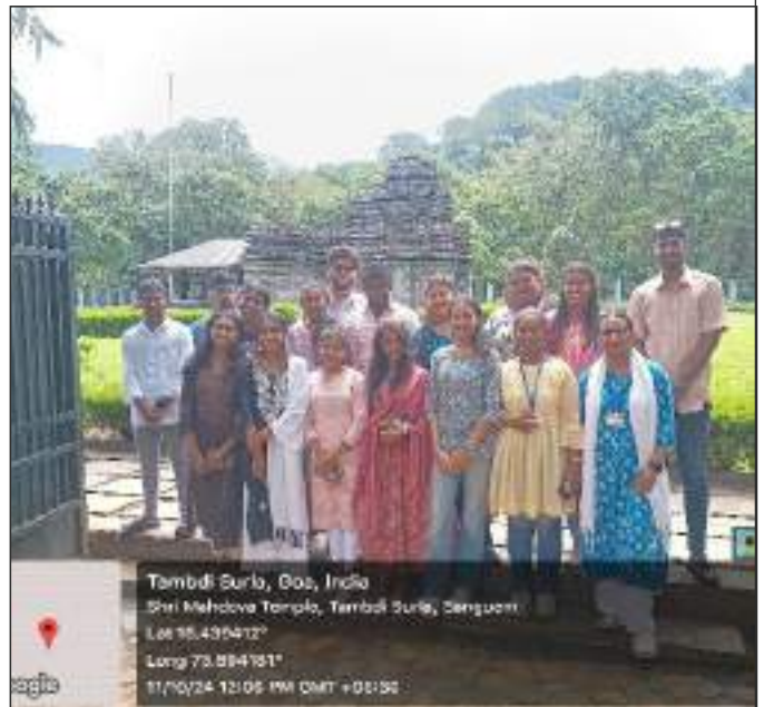
Field Trip to Tambdi Surla on 11.10.2024.