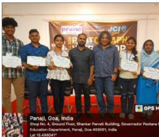
Participation of students in All Goa Photography Workshop organised by Prime Media Goa at Panaji on 23.08.2024.