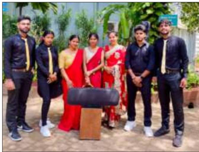
Participation at Aloysian Fest 2024 – National-Level Undergraduate Fest organised by St. Aloysius College, Mangalore on 08.10.2024.