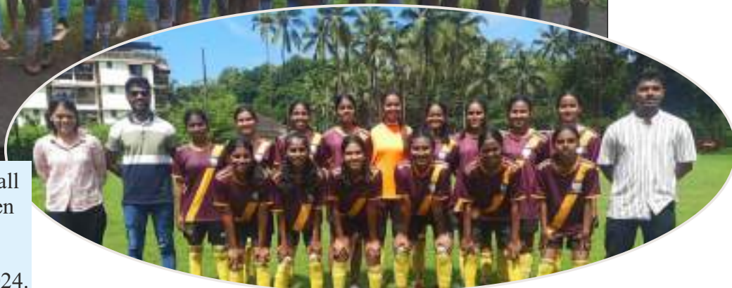
Inter-collegiate Football Championship for men and women at Goa University from 17.09.2024 to 07.10.2024.