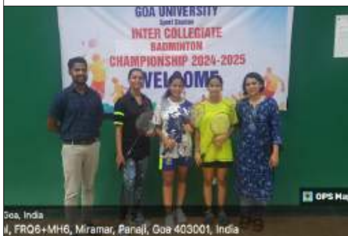
Inter-collegiate Badminton Championship at Goa University on 30.07.2024 to 02.08.2024.