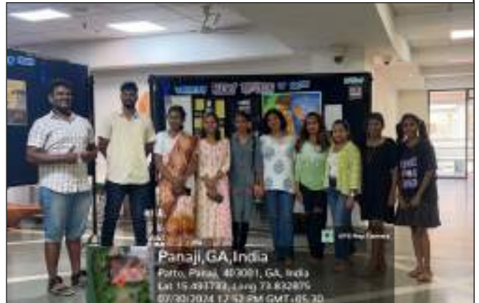
Participation of students in UN World Day on Anti Trafficking in persons at Sanskruti Bhavan, Panaji on 30.07.2024.