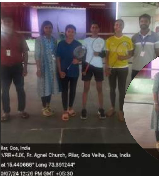
Pilar, Goa, India VRR+4JX, Fr. Agnel Church, Pilar, Goa Velha, Goa, India at 15.440666° Long 73.891244° 10/07/24 12:26 PM GMT +05:30