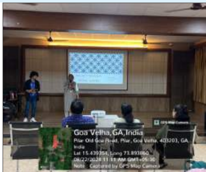
Pitch your Idea Contest on 22.08.2024.